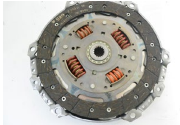
Example of a friction disc with a Larger ID than the Pressure Plate friction surface.