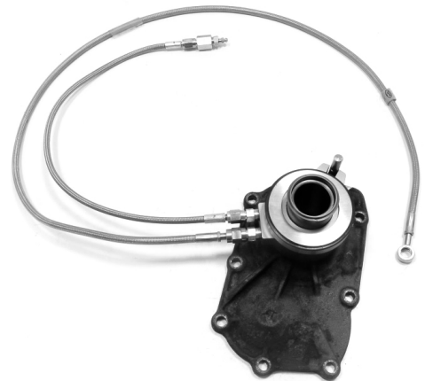
GUIDE PIN FITTED TO NOSE CONE ON R154 TRANSMISSION